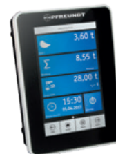
1 Weighing electronics