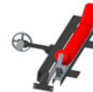
2 Weighing frame BW-2