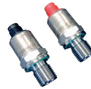
2 Pressure sensors