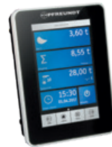
1 Weighing electronics