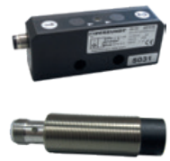
3 Proximity switches